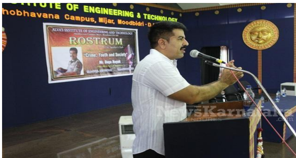
Chief guest addressing the gathering at AIET Auditorium

Outcome: He was speaking on Crime, Youth and Society after inaugurating Rostrum, Speakers club organised by Alva's Institute of Engineering and Technology, on 6 th september 2016, at AIET Auditorium, Mijar. There were around 860 students who witnessed the event. The police department is responsible for maintaining law and order in the society and citizens are equally responsible to cooperate with the department and follow the law, he noted.