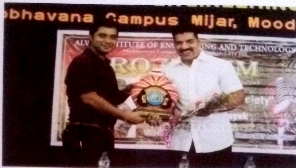
Presenting a memento to the chief guest as a token of gratitude

ALVA'S INSTITUTE OF ENGINEERING & TECHNOLOGY Shobhavana Campus, MIJAR-574225, Moodbidri, D.K., Karnataka, Phone: 08258-262725, Fax: 08258-262726