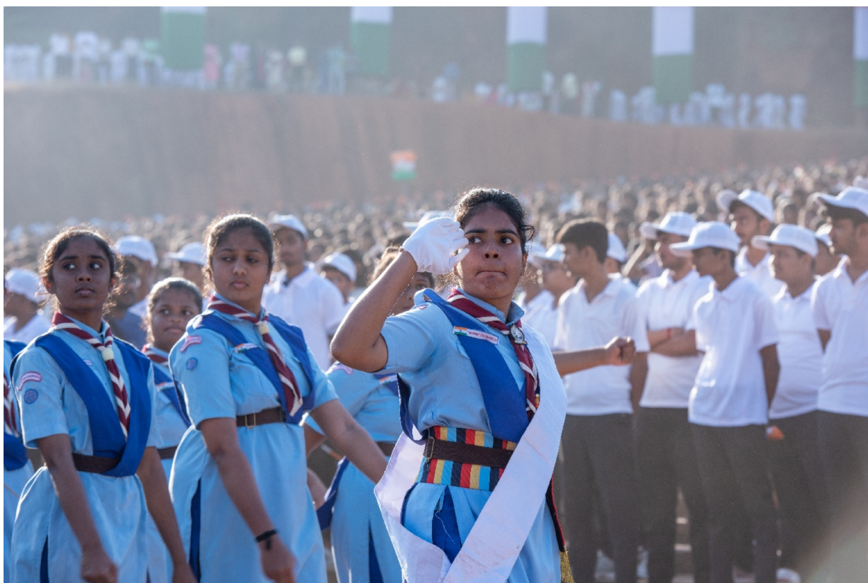
Scouts and Guide Cadets parade at Republic Day – 2020.