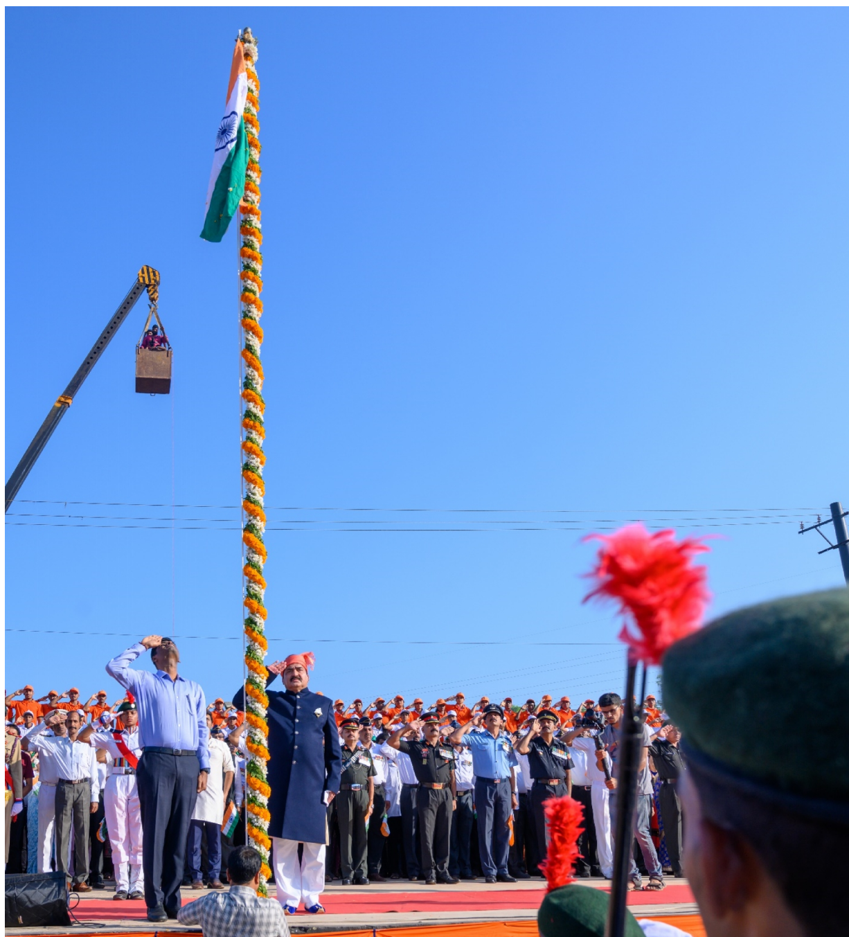
Former IPS Officer K Annamalai, unfurl the national flag.