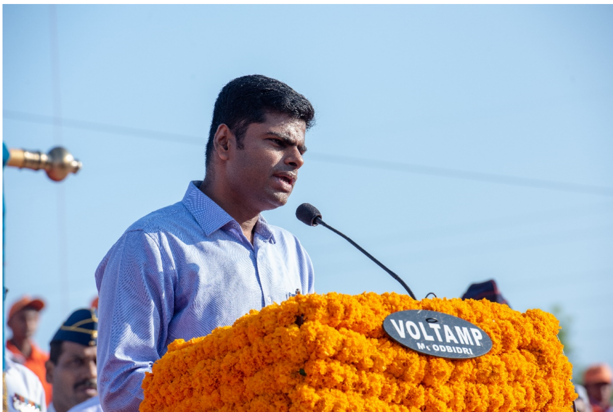
Former IPS Officer K Annamalai addressing the gathering.

After unfurling the national flag, former IPS Officer K Annamalai said, “The dream of former president APJ Abdul Kalam that India should become a superpower by 2020 is still a distant dream. The best way to realize his dream is through involving ourselves in the process of nation-building and living a life of duty towards ourselves and the nation. Nation has given everything to us, but we ask honestly ourselves what we had given to the nation? Republic day is the best time which reinstates each citizen to bind towards his duties. He added and said, whatever may be circumstances, the nation should come first and then our religion, place and name”.