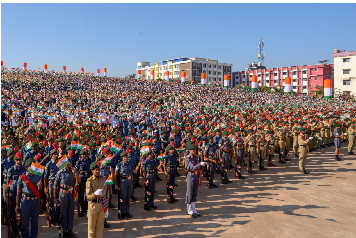
All Students waved national flag in air during the rendition of the integration song, 'Koti Kantose'.