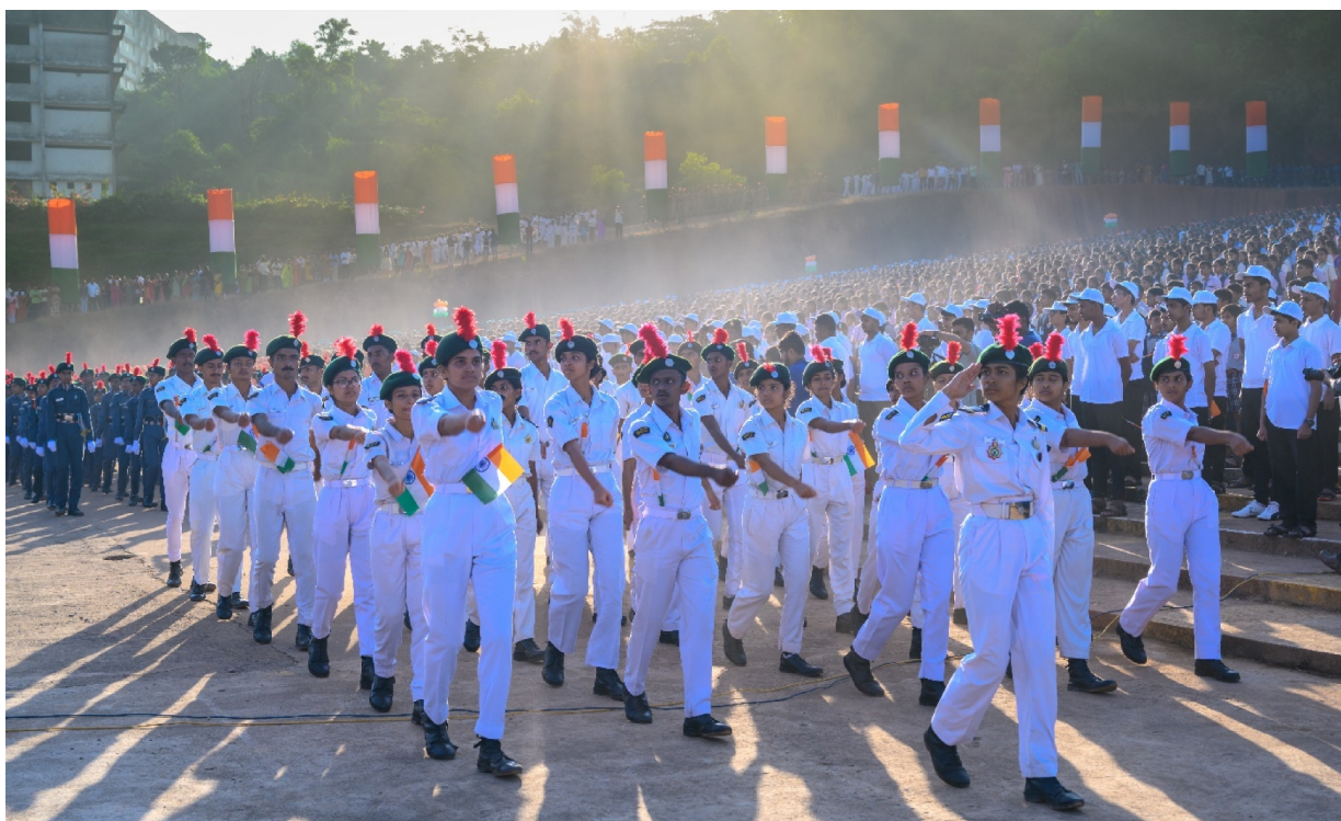
Navy Cadets parade at Republic Day – 2020.