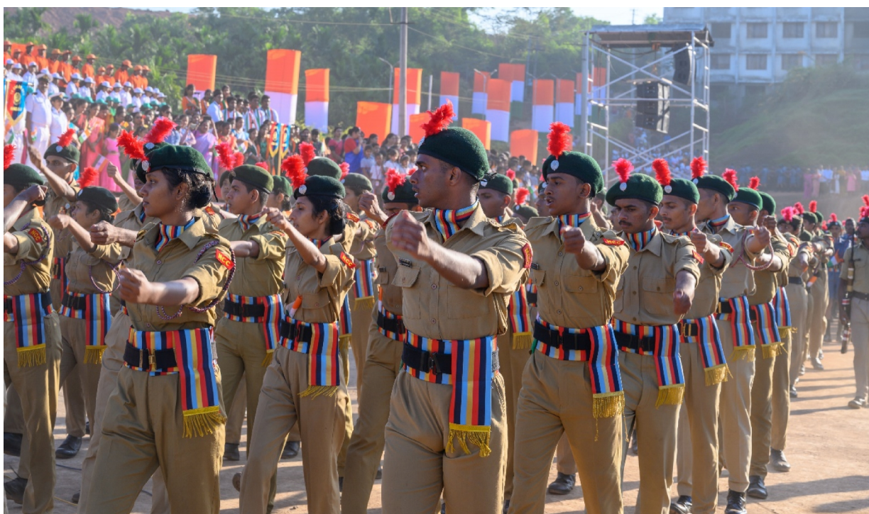
NCC Cadets parade at Republic Day – 2020.