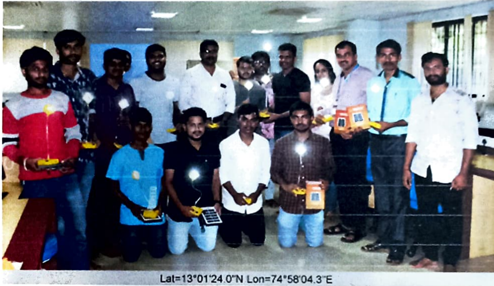
Program Officer and volunteers with the assembled lamps