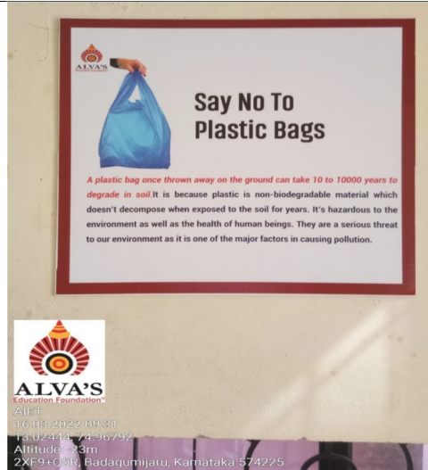
(5a) Plastic Awareness display boards at AIET.