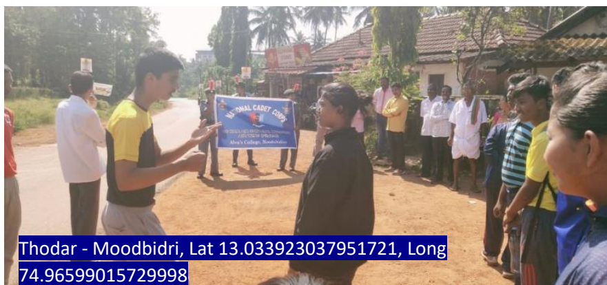
Giving awareness to the public during Beti Bachao Beti Padoo event