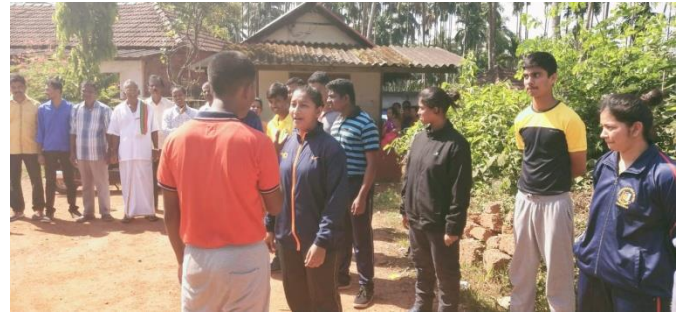
Giving awareness to the public during Beti Bachao Beti Pado event

There were around 30-40 people in the scenario, which means we created awareness among 30-40 houses in just 20 minutes. As a part of street play, the pedestrian and shopper keepers, came and saw us perform. As the crowd was created we started our performance.