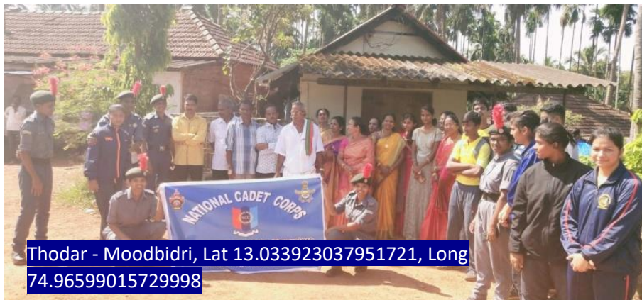
NCC Cadets during Beti Bachao Beti Padoo event

According to census data it was revealed that population ratio of India in 2011 is 943 female per 1000 males. So we the NCC cadets of 6 KAR AIR SQN NCC [Flight-B] on 28 th Oct 2018, Mangalore as a part of social activity decided to create awareness in the people of THODAR, regarding Beti Bachao,Beti Padhao. We being studying in the professional course decided to present it in a creative way .Instead of going to each and every house , we just presented it in the form of street play which grabbed the attention of the ramblers.