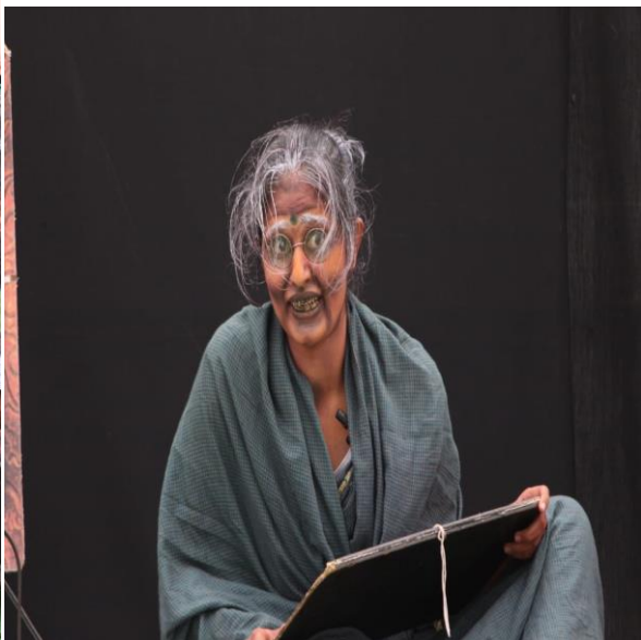
Performing skit at the competition.