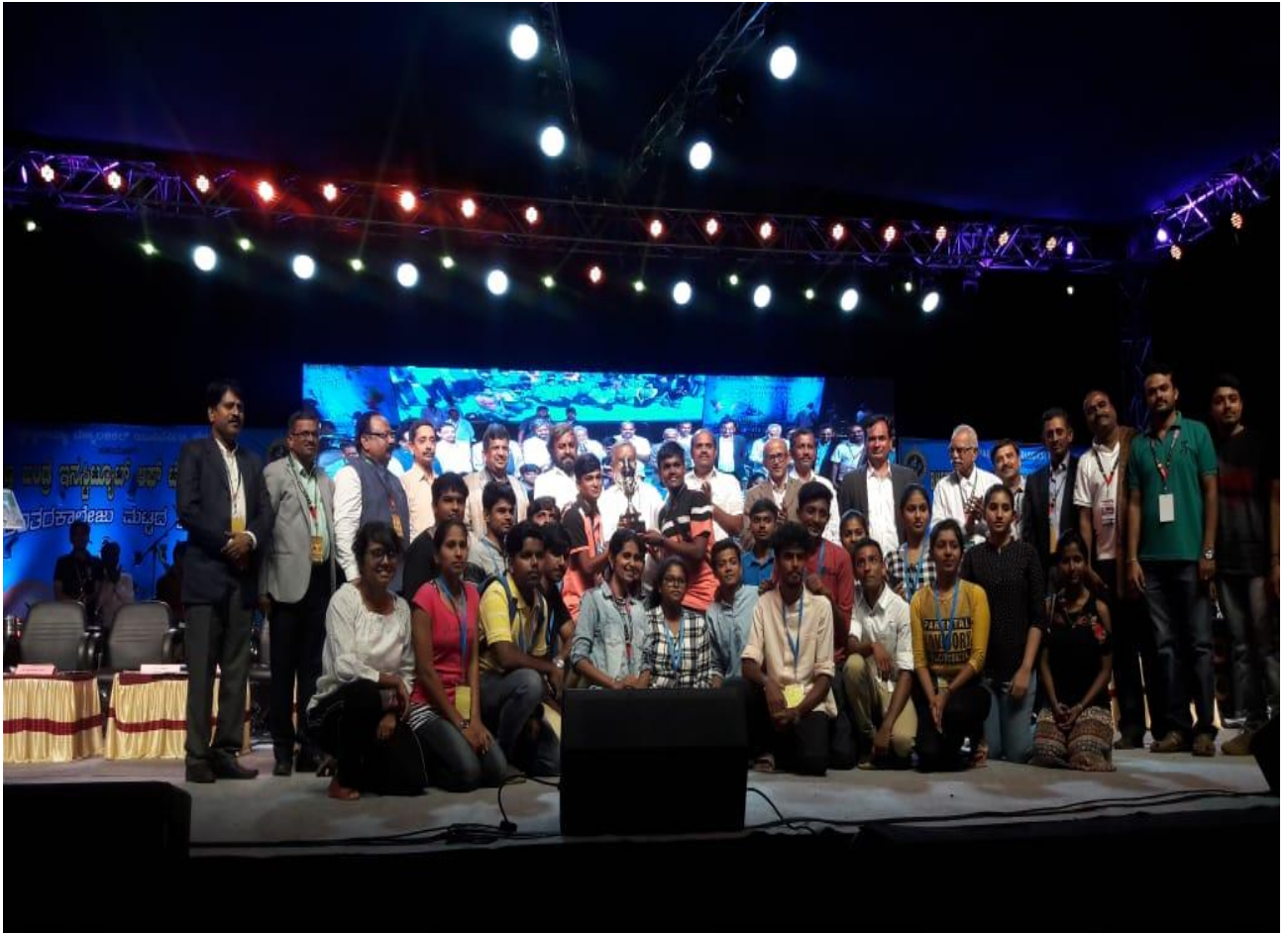
Receiving the Trophy by the Chief guest.