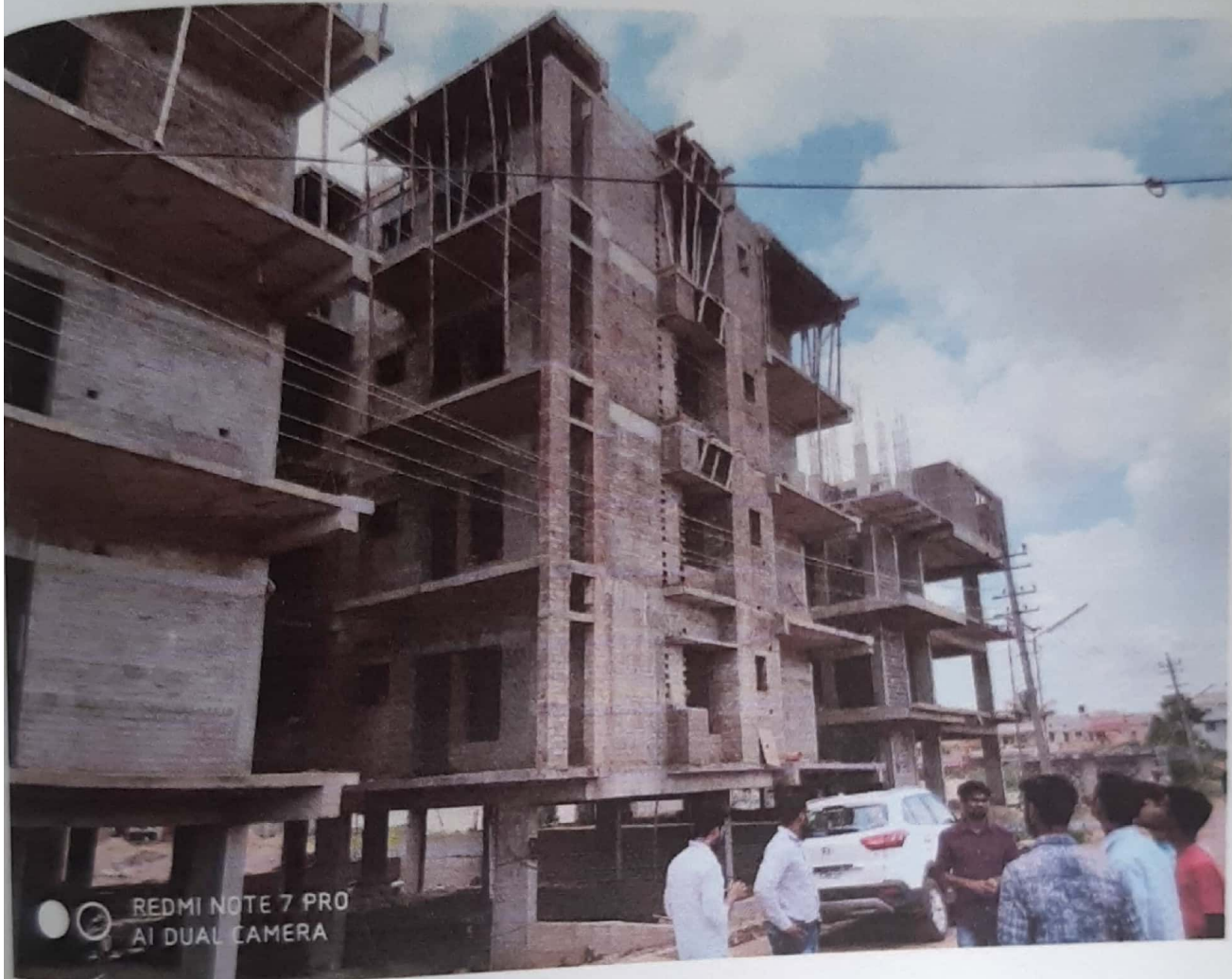
Figure 4.2.4: Hill View Apartment near Police Layout