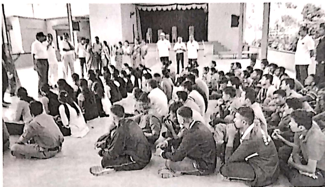
Ex-servicemen addressing the volunteers