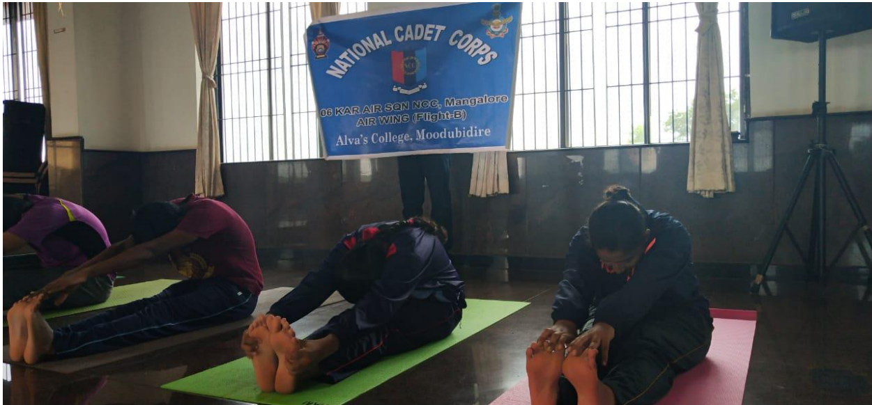
Few glimpse of 5 th international YOGA day