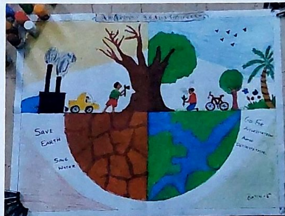
Students preparing and presenting posters on environmental awareness campaign