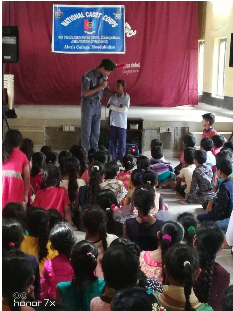
Cadets creating awareness to the children regarding health