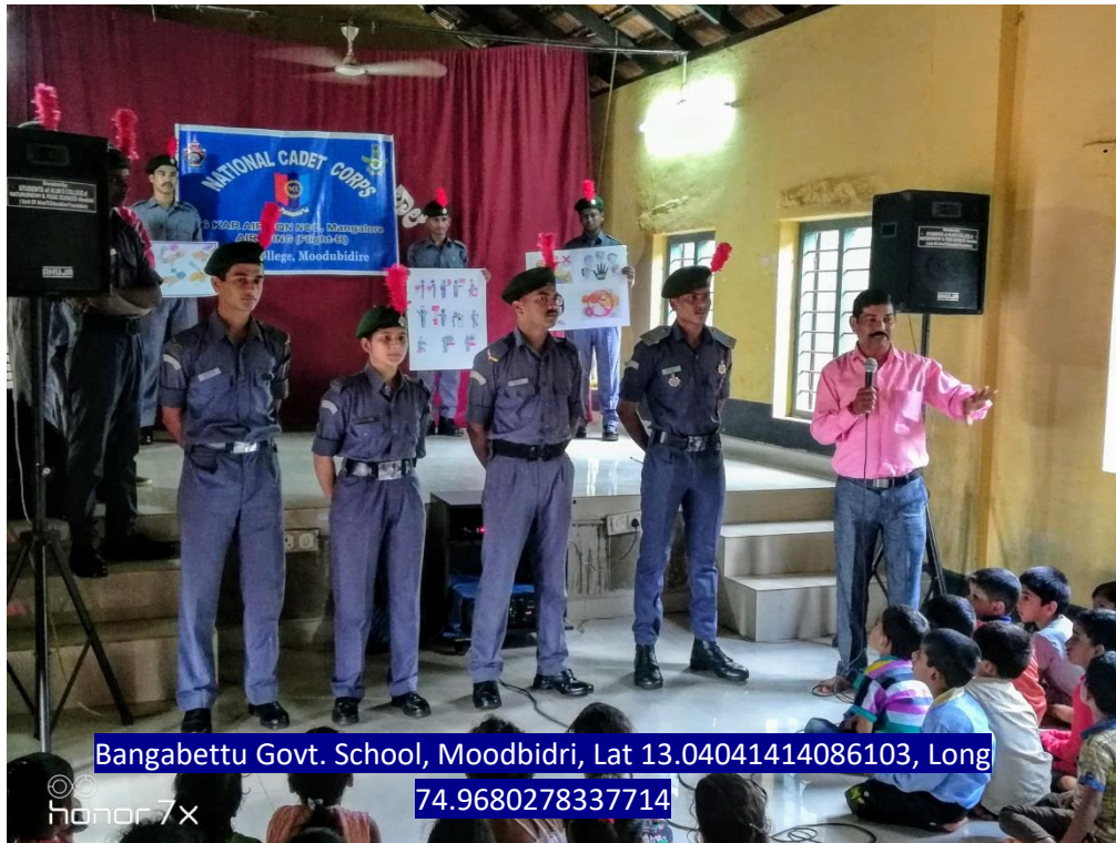
Bangabettu Govt. School, Moodbidri, Lat 13.04041414086103, Long 74.9680278337714