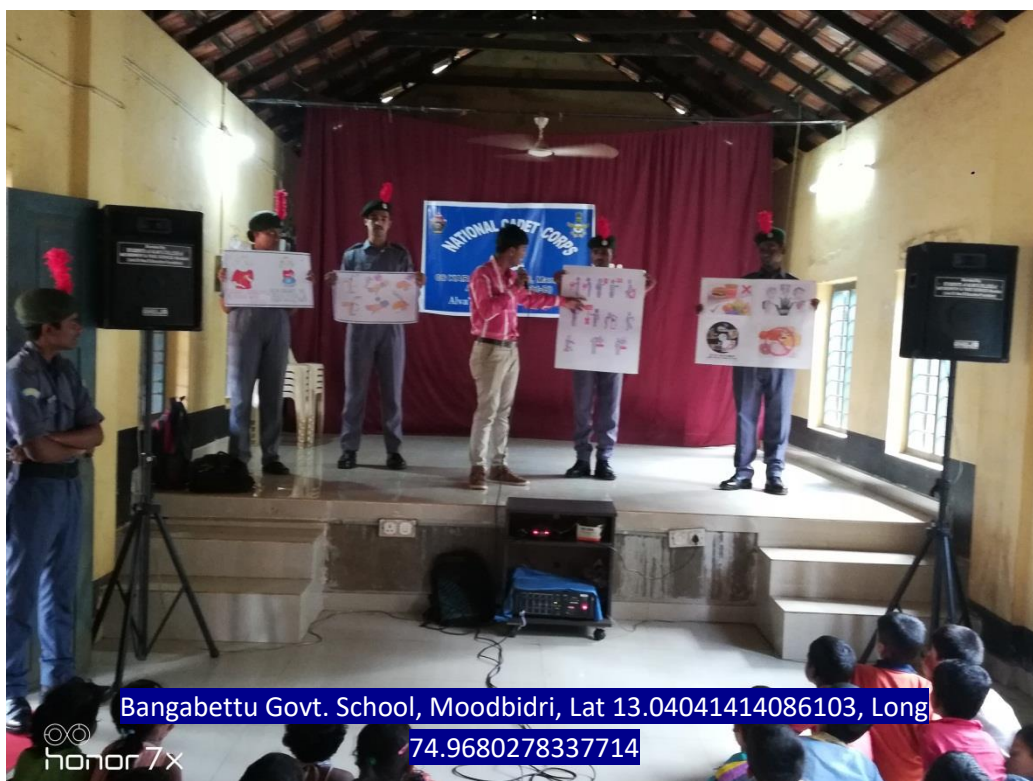
Bangabettu Govt. School, Moodbidri, Lat 13.04041414086103, Long 74.9680278337714

Cadets creating awareness to the children regarding health