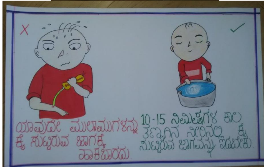
Posters used for health awareness program