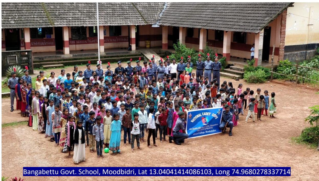
Bangabettu Govt. School, Moodbidri, Lat 13.04041414086103, Long 74.9680278337714

Health Awareness program under Swachta Aryan, conducted on 01 st Sept. 2018 by 6 kar Air sqn NCC (Flight B) of Alva's College cadets. Total of 25 cadets & ANO visited the Government primary school at Thodar, to create awareness among 196 children about HEALTH AND HYGINE and about First aid for the injured person and demonstrated how to overcome when there is any electric shock.