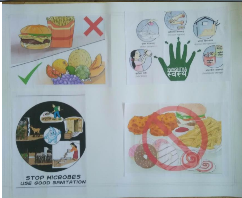
Posters used for health awareness program