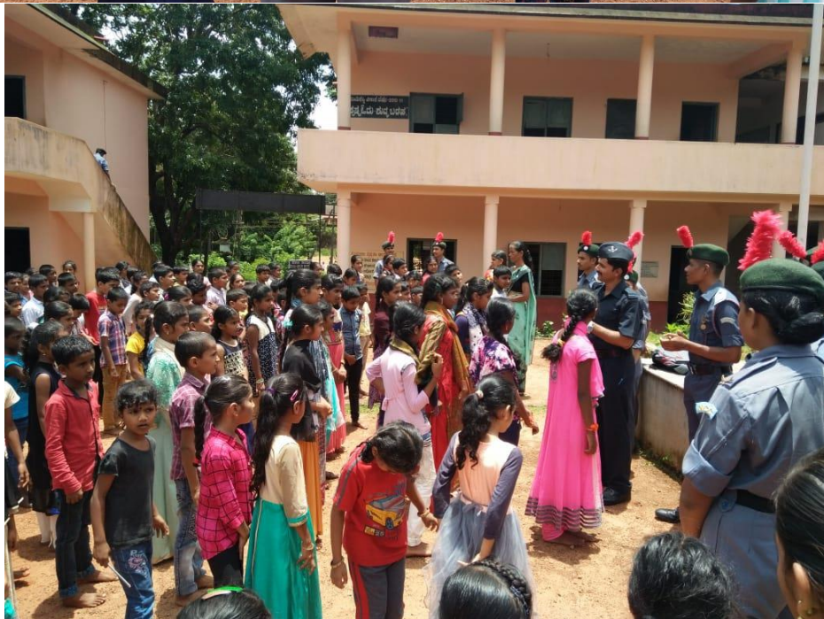
Cadets creating awareness to the children regarding health