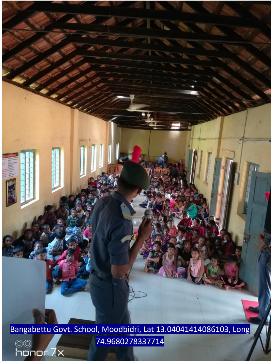
Cadets creating awareness to the children regarding health