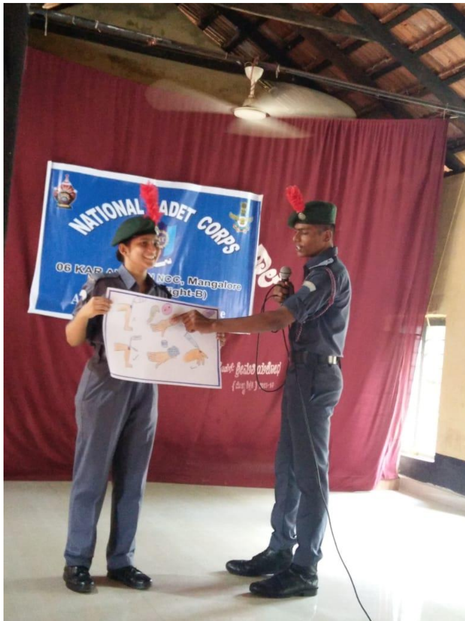
Cadets creating awareness to the children regarding health