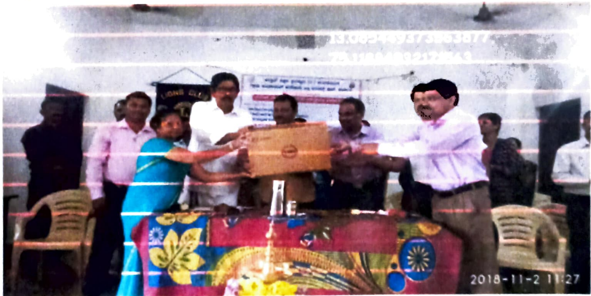
Principal donating Computers to School Head Master

Giving the Basic knowledge of MS-Word, MS-Excel, Paint etc. Giving the basic knowledge about MS-Word which is extraordinarily useful for them and allows to be more creative and also opens up a wide range of knowledge. MS-Excel is done as essentially with set of formulas to calculate the values. These values have been calculated by using formulas. By this student have understood slightly about how to use MS-Excel. Our student coordinators taught how to use paint option in computer and how to use it.