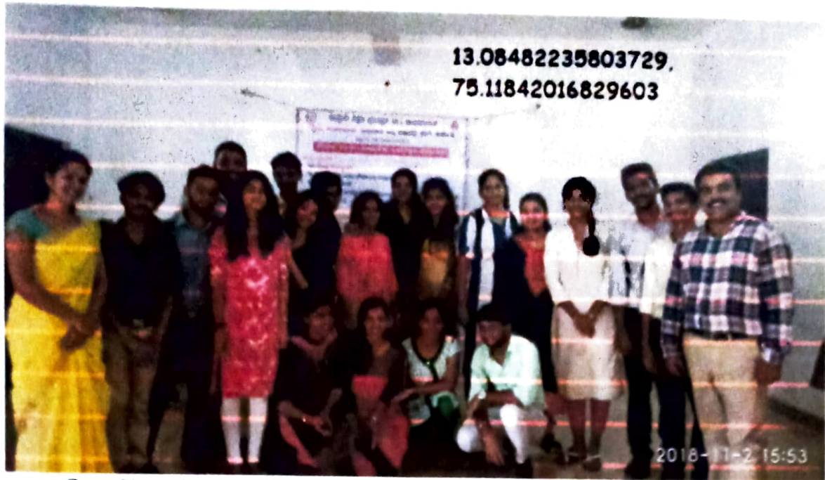
Group Photo of students B.E students participated Rural Computer Education Camp

Nearly 145 students of the 8 th & 9 th Standard of Govt. Kannada Medium High School, Marodi, Dakshina Kannada Dist, Karantaka were actively participated in the 3 days "Kaliyona Computer-Rural Computer Education Camp" and get benefited by the program. About 25 Final year students and 4 faculty members of the department of CSE were participated in the program. The institution donated the 4 computers to the school. Most of the school students doubts related to computer fundamentals were cleared with real-time examples. The AIET students were gained a special experience by teaching computer fundamentals to the school pupils.