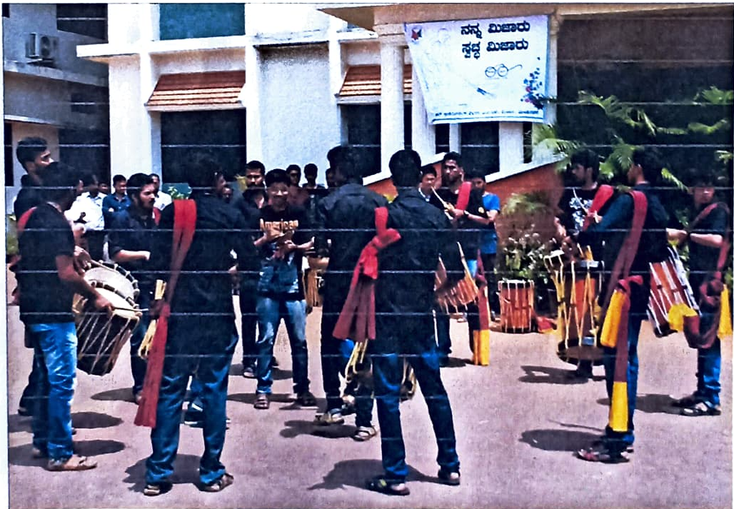
Students performing Chende, prior to the cleaning event