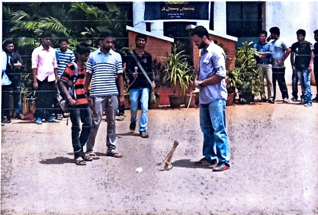
Students playing a skit to create awareness on cleanliness