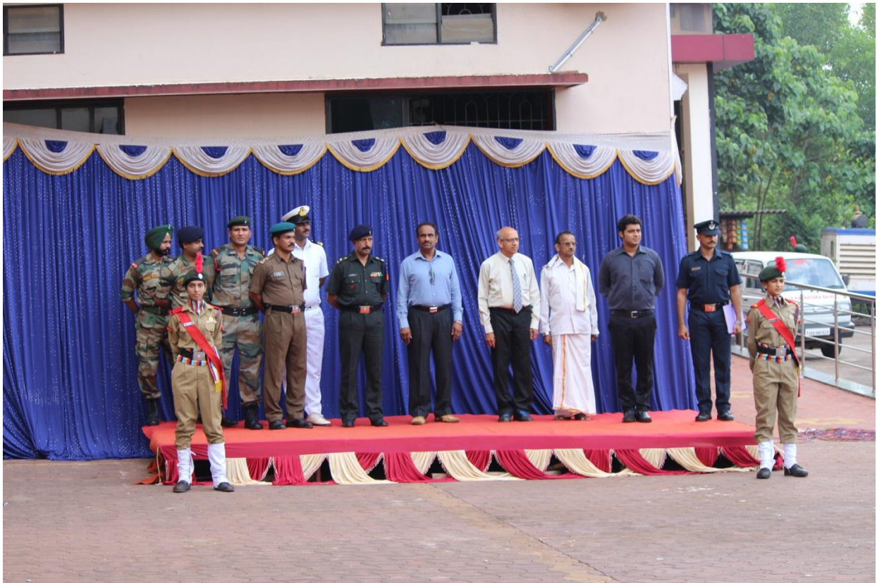
Inaugural Ceremony of Annual NCC Program