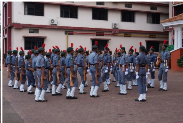
Guard of honor and march past by the Cadets