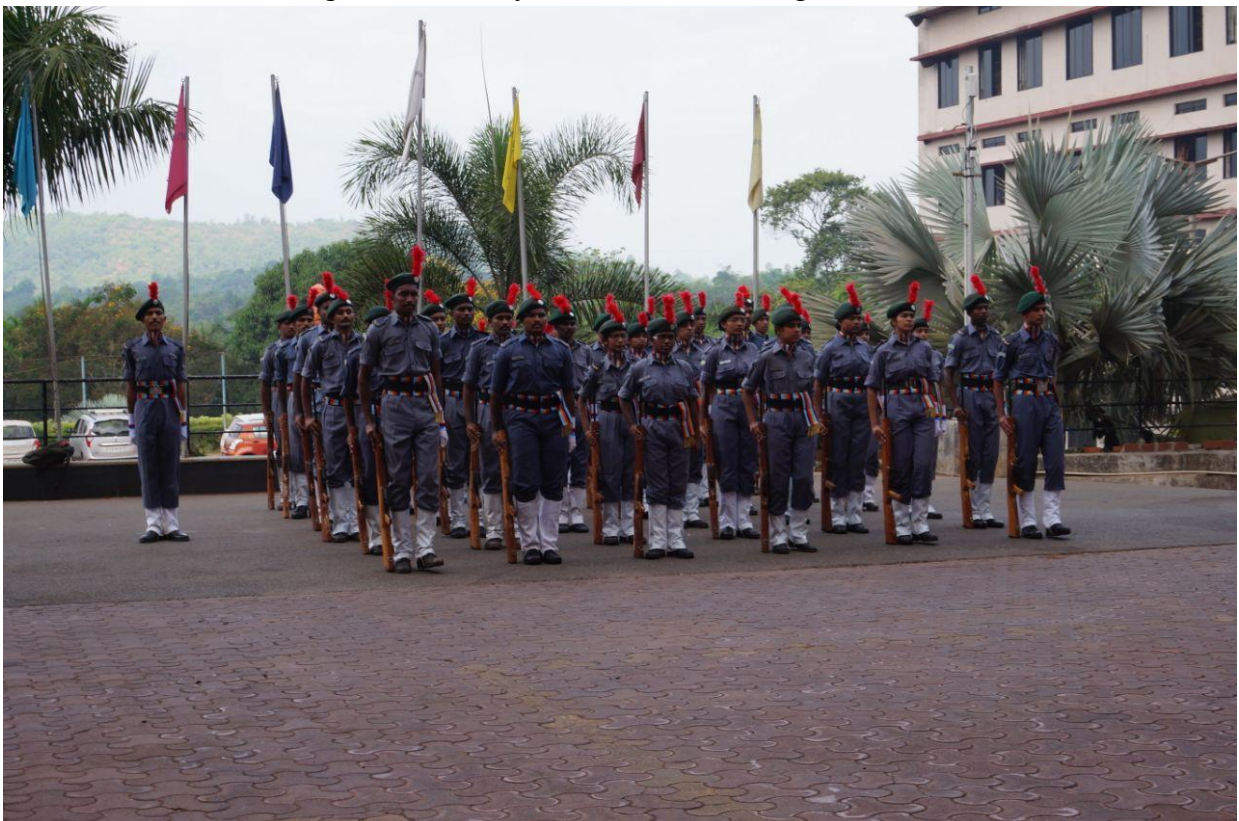
Cadets take part in the annual NCC program