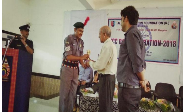
March past by the cadets followed by Prize distribution for best Cadets