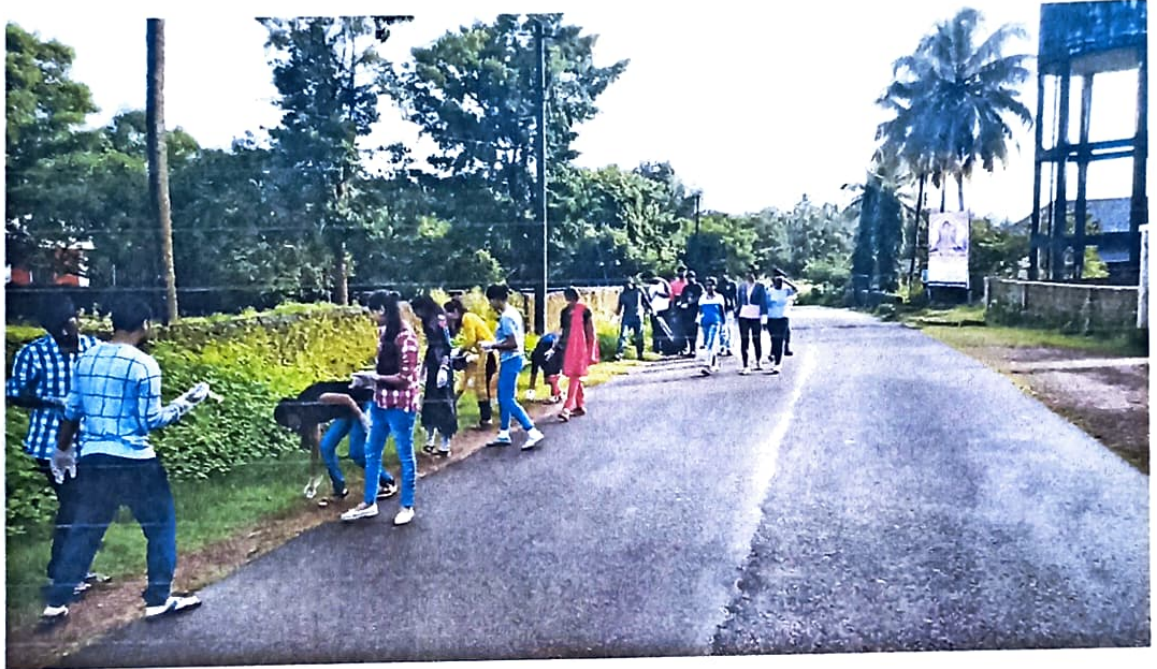
Students in cleaning action

Outcome: The students have taken up the objective of "Swachh Mijar" as their major role in keeping the adopted village of "Mijar" clean and tidy. The swachhta activities conducted cover the Amaranagara village, where about 200 houses are located, benefiting from this cleaning activity.