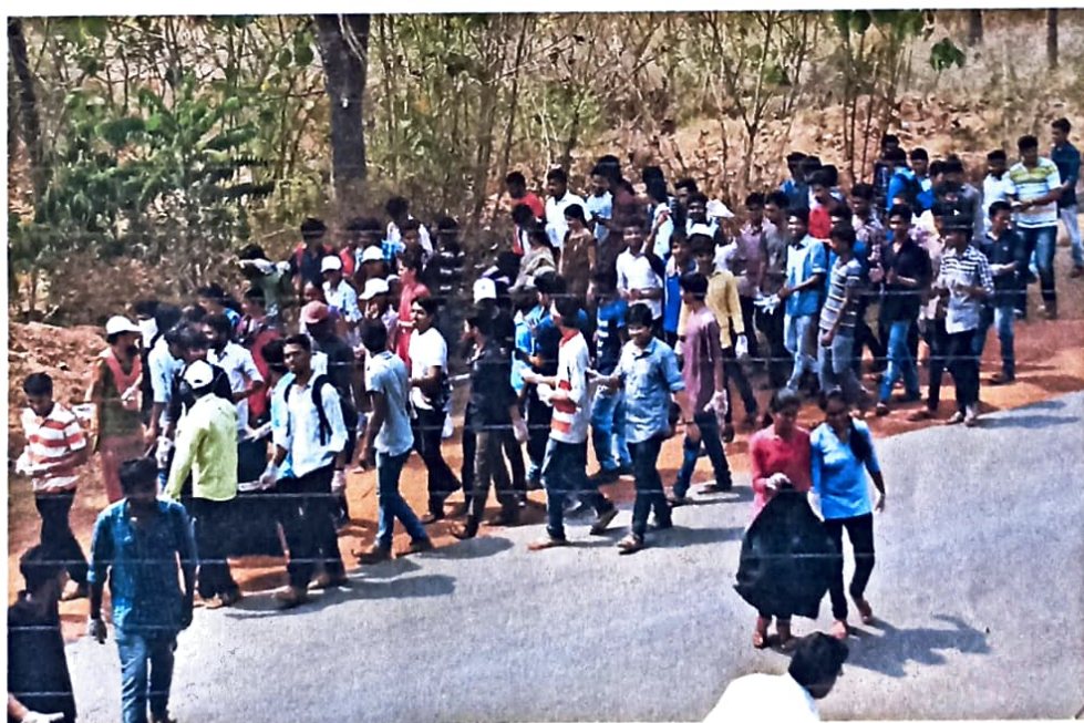
Students in cleaning action