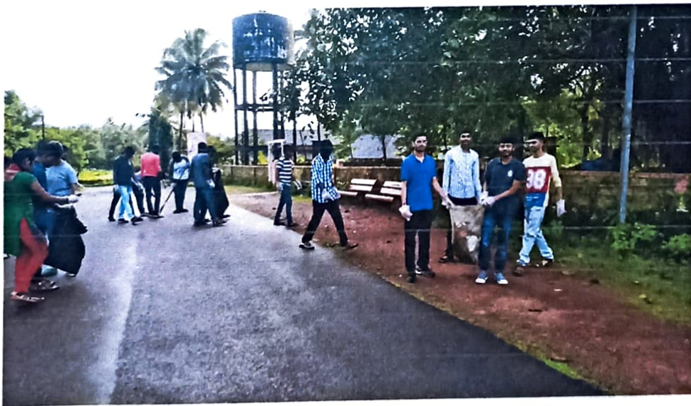
Students in action at Amaranagara