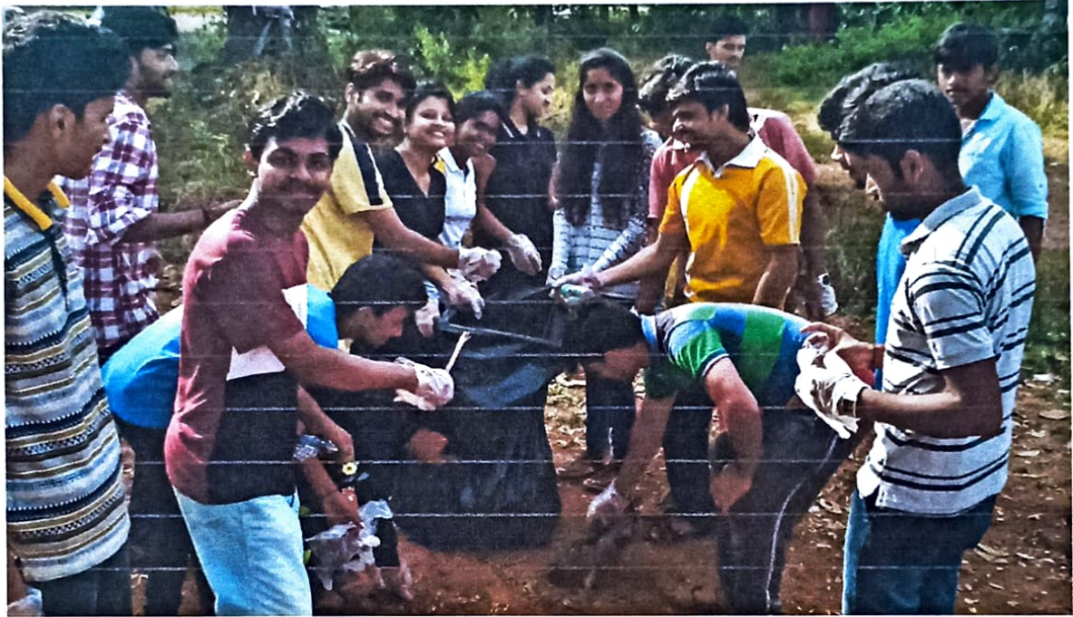
Enthusiastic volunteers in action

Outcome: The students have taken up the objective of "Swachh Mijar" as their major role in keeping the adopted village of "Mijar" clean and tidy. The swachhta activities conducted cover the Nooyi village, where about 150 houses are located, benefiting from this cleaning activity.