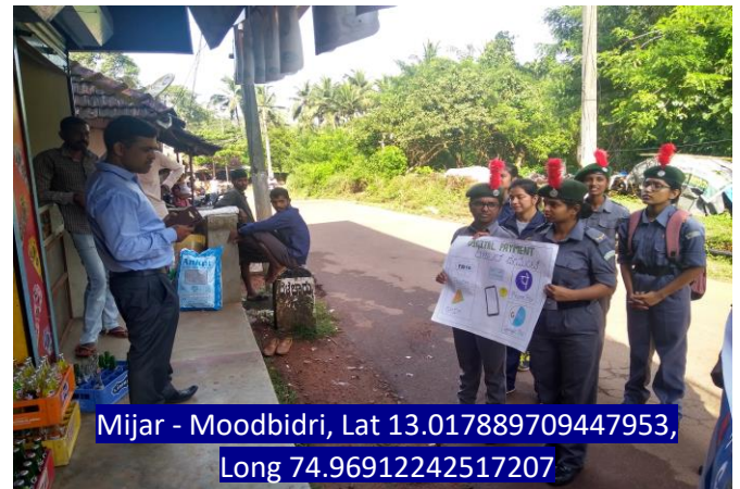
Mijar - Moodbidri, Lat 13.017889709447953, Long 74.96912242517207

Door to door campaign by NCC Cadets during the digital payment campaign