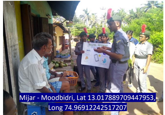
Mijar - Moodbidri, Lat 13.017889709447953, Long 74.96912242517207