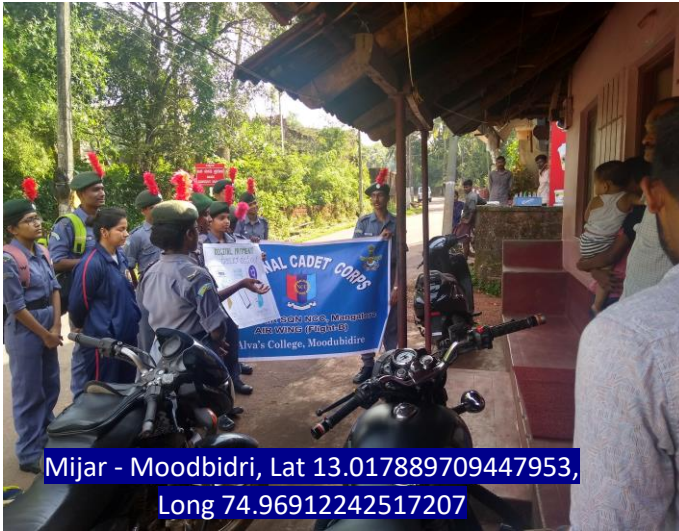
Mijar - Moodbidri, Lat 13.017889709447953, Long 74.96912242517207