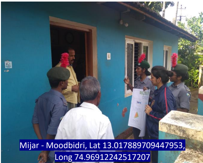
Mijar - Moodbidri, Lat 13.017889709447953, Long 74.96912242517207