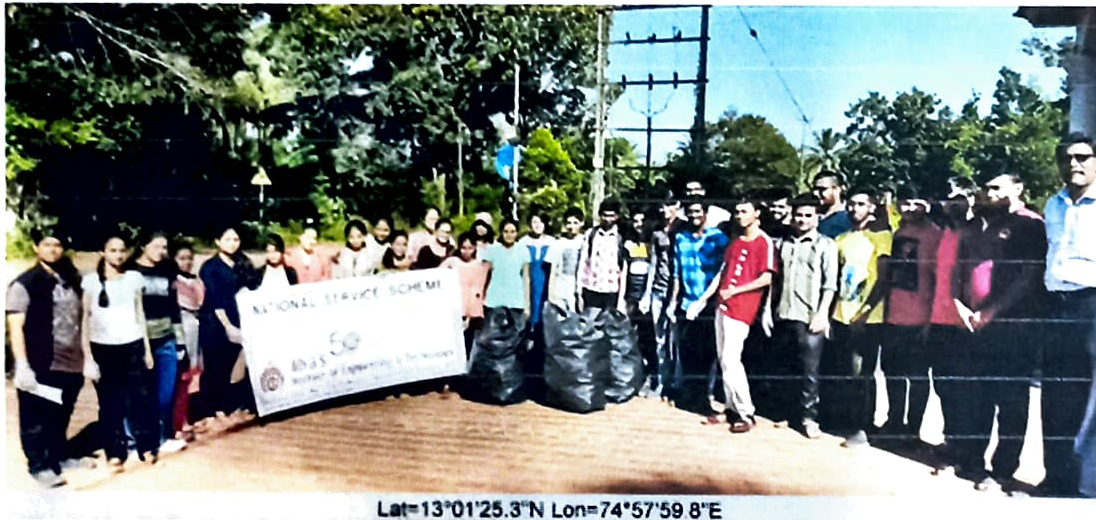
The volunteers and the collected wastes in garbage bags

Outcome: The residents of Mijar village developed awareness about waste disposal by segregating solid and wet waste. Volunteers developed a positive outlook and attitude towards the environmental sustainability. Volunteers also developed social consciousness and commitment.