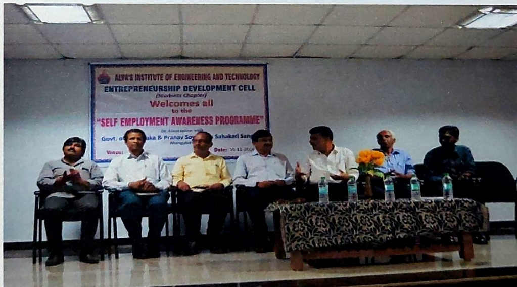
Guests on the dais during the inaugural Programme