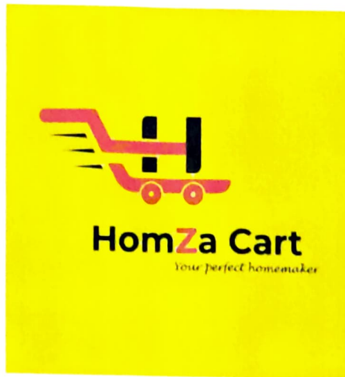
HOMZA Cart Logo

The project also aims to increase internet usage in rural India and make things available for them at their door steps because mobility is a major problem faced by the rural India.