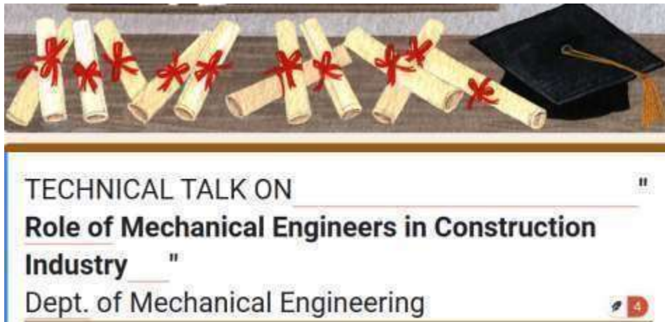
Contribution to learning