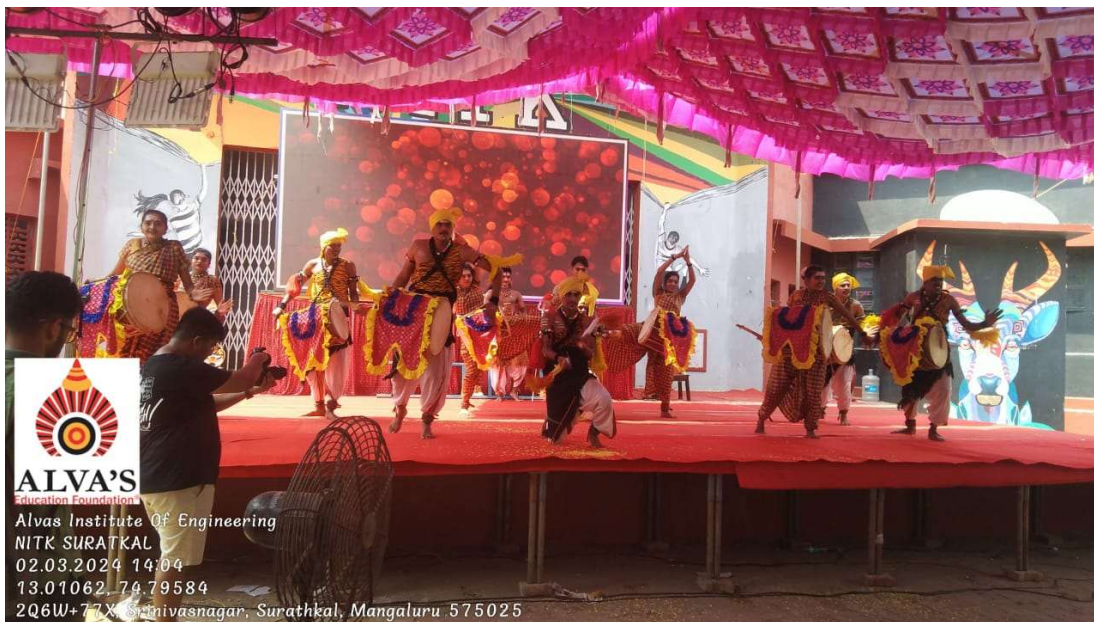
Folk dance performance