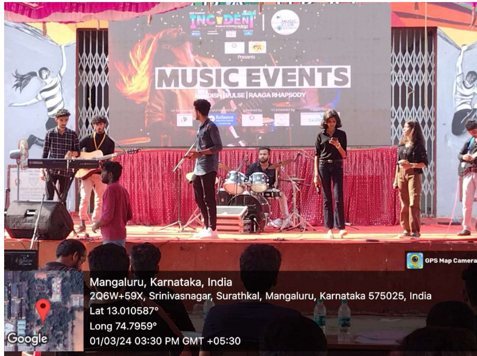
Group singing performance by music team