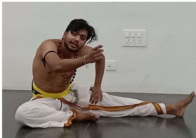
Solo acting performance