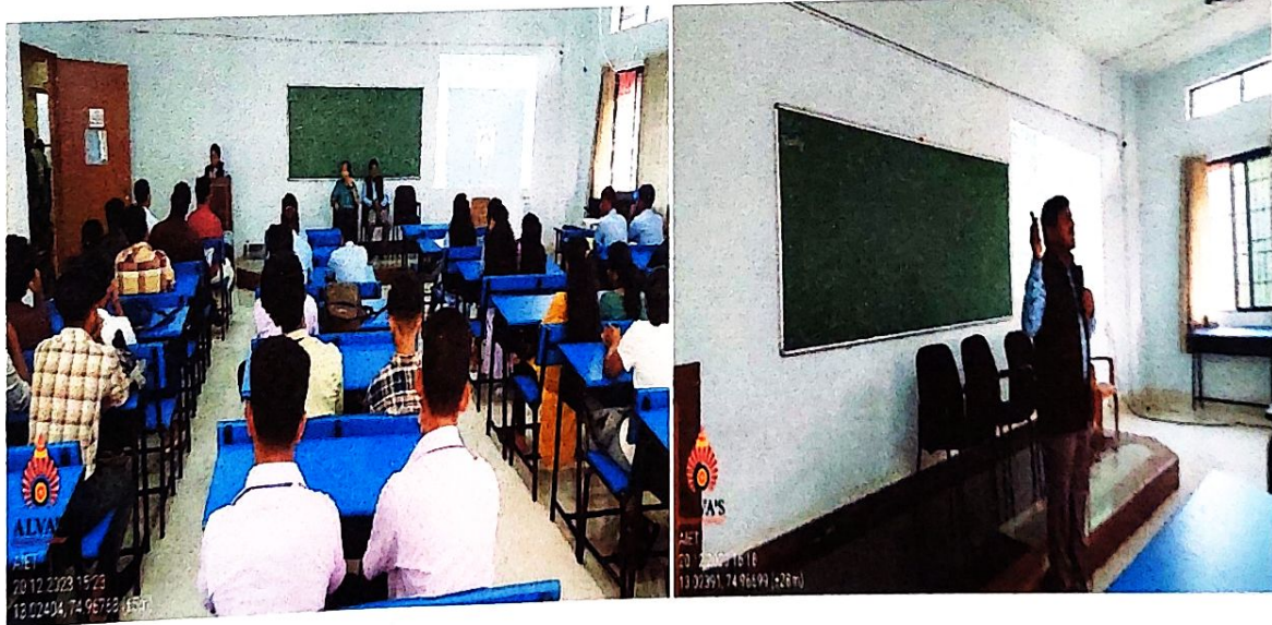
Resource Person addressing the students on concepts of green building

By addressing these facets, Rajendra Kalbhavi aims to mitigate the negative environmental impacts associated with modern construction, thereby promoting a more sustainable and eco-friendly approach to building design and construction.