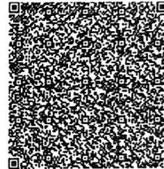
E-Invoice QR Code

Dear BSNL Customer, Make the payment of your Advance Bill for FY 2024-25 before March 31, 2024 and get a Special Discount of 1% i.e. Rs 5085 on Current Invoice Amount (Excluding Taxes). *Terms and Conditions Apply.