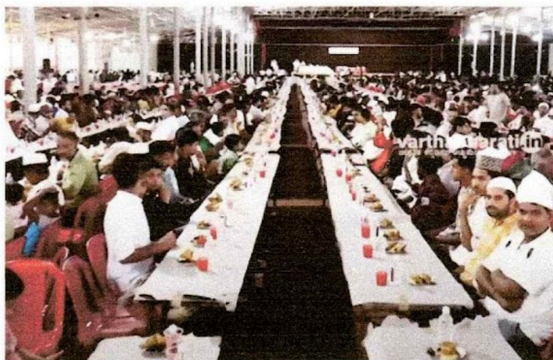
People seating for iftar at Alva's Ifthar koota -2023

Iftaar koota was organized on 30 th March at 6.00pm in Nudisiri Vedike, Vidyagiri. All the Deans', HODs', Teaching and Technical staff accompanied this event with more than 1200 students of Alvas Education Foundation. Students preparing for evening prayer made wudu. Followed by the prayer, water, fruits and dates were served to break the fast. All performed prayer of Maghreb. Then delicious dinner was served for all who attended Iftaar Koota.