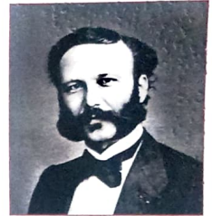
Jean Henry Dunant Founder of Red Cross (1828-1910)

To Alvas institute of Engineering & Technology moodahidni