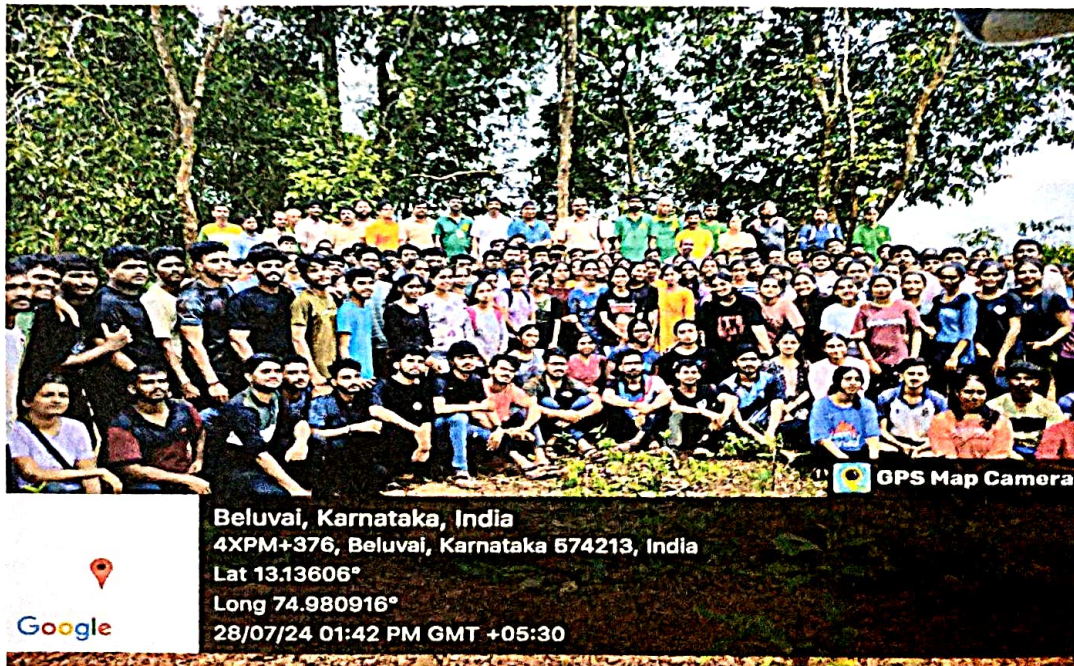
Student Team Participated in the event