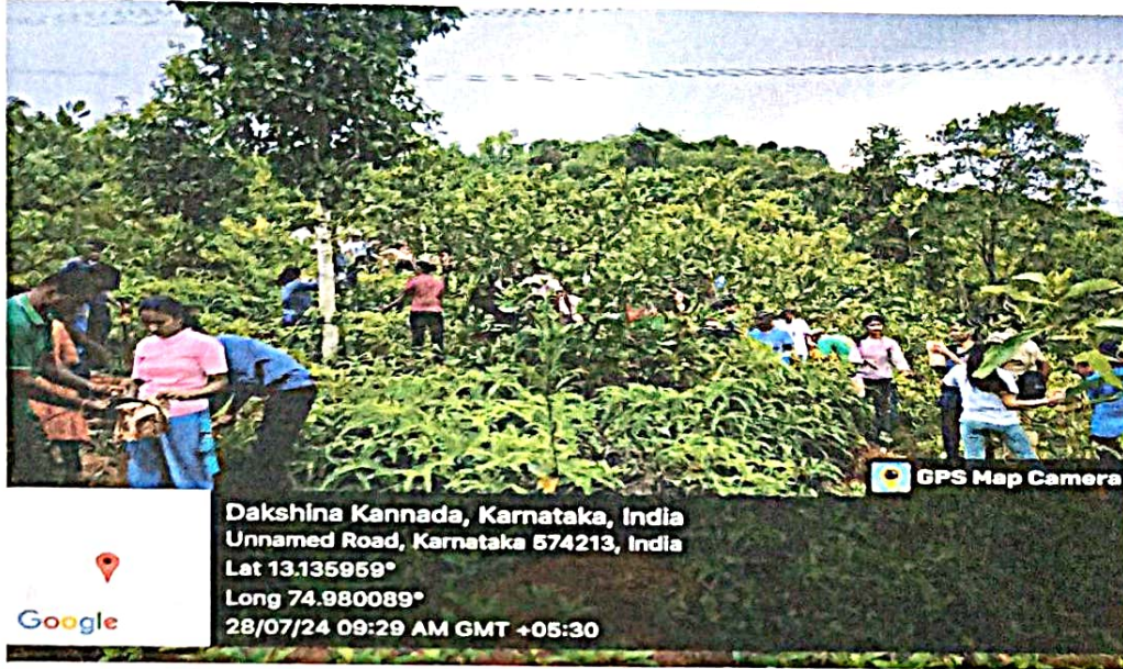
Students engaged in plantation

Students along with the Forest Department and National Environment Conservation Federation team planted 500 plants belonging to different varieties. A total of 180 students participated in this event.