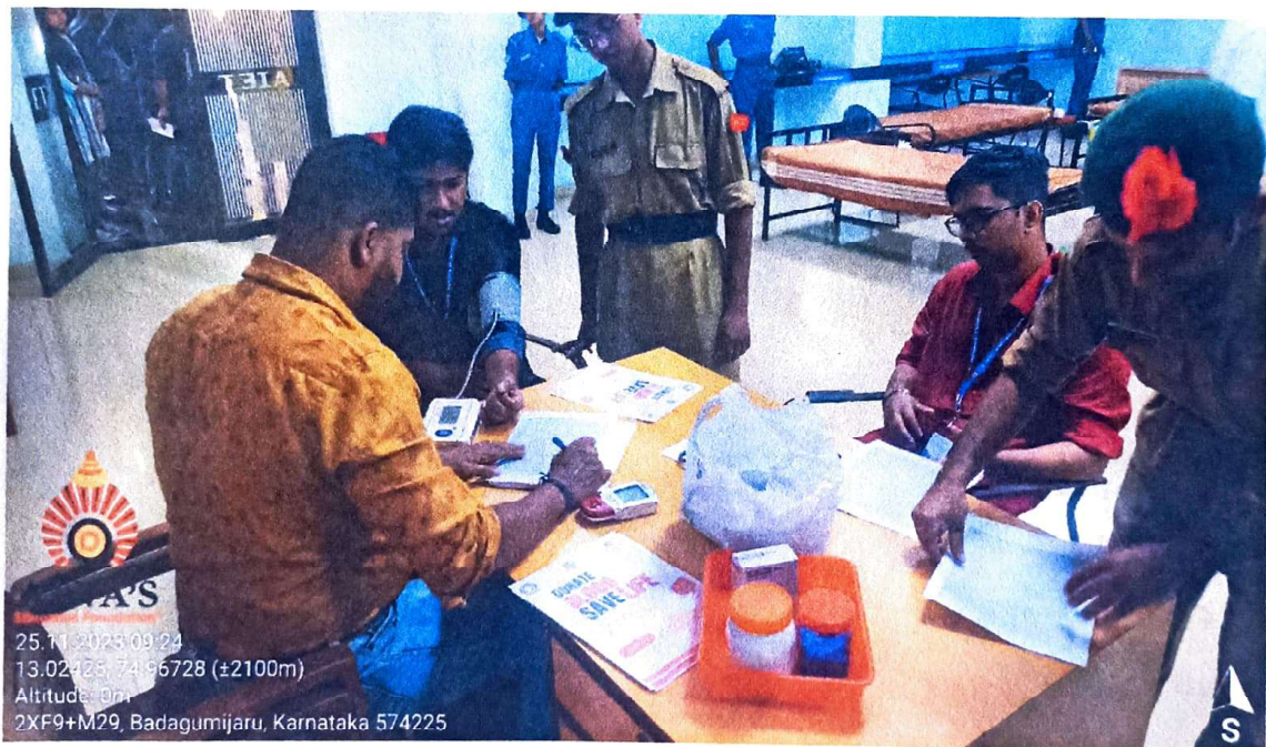
Checking general health of the donor before blood donation

Outcome: A total of 164 units of blood were collected. Participating volunteers benefited from the event by gaining hands-on experience in event management, communication skills, and teamwork. They also developed a sense of fulfilment and satisfaction from contributing to a lifesaving cause, further strengthening their sense of social responsibility and empathy towards others in need.