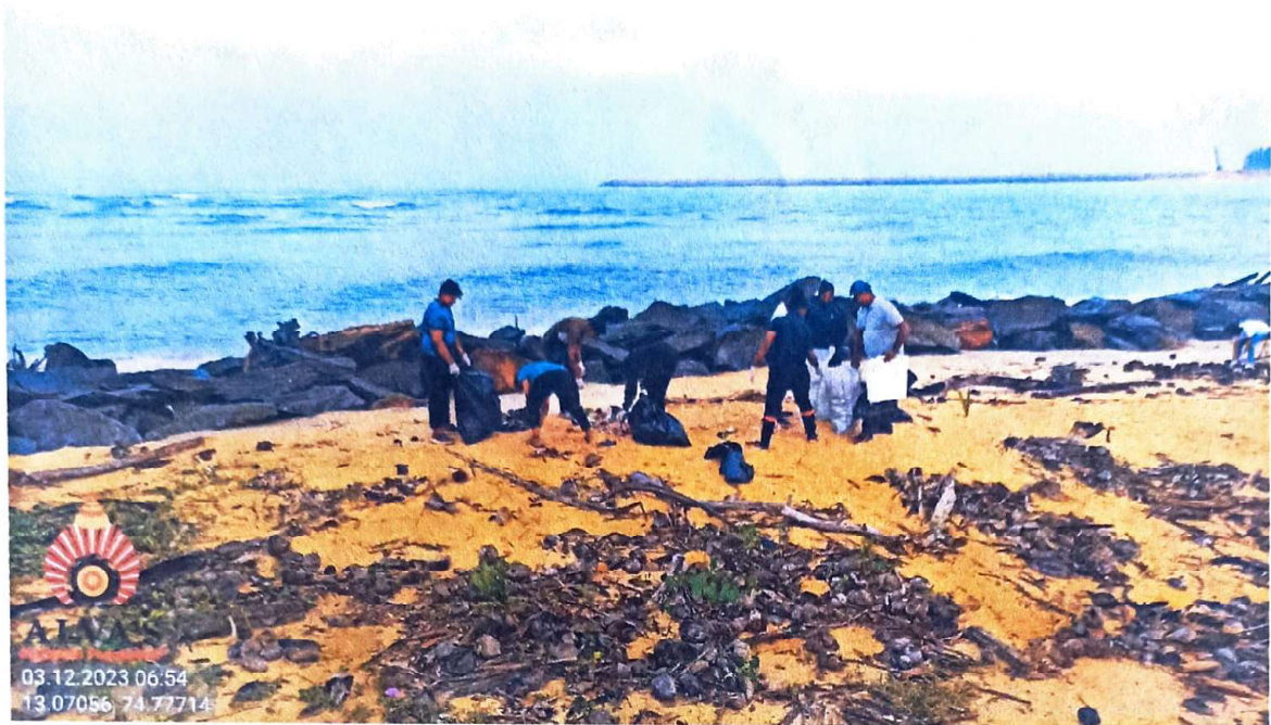
Volunteers in action