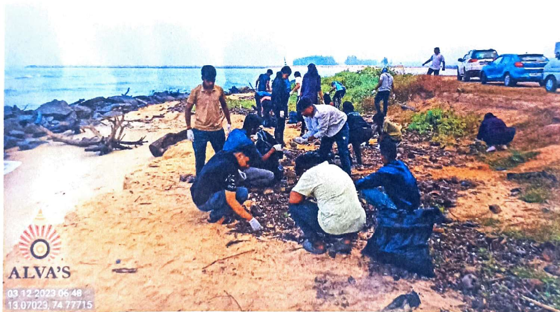
Volunteers segregating foam, rubber and bottles from the trash

Outcome: Through this beach cleaning initiative, both participants and the community experienced several tangible benefits. Firstly, the beach environment was visibly improved, enhancing its appeal to visitors and preserving its natural beauty. Additionally, the event fostered a sense of environmental stewardship among participants, empowering them to take proactive steps towards conserving their local ecosystem. Finally, the initiative helped raise awareness about the importance of ocean conservation and the need for sustainable practices within the community.