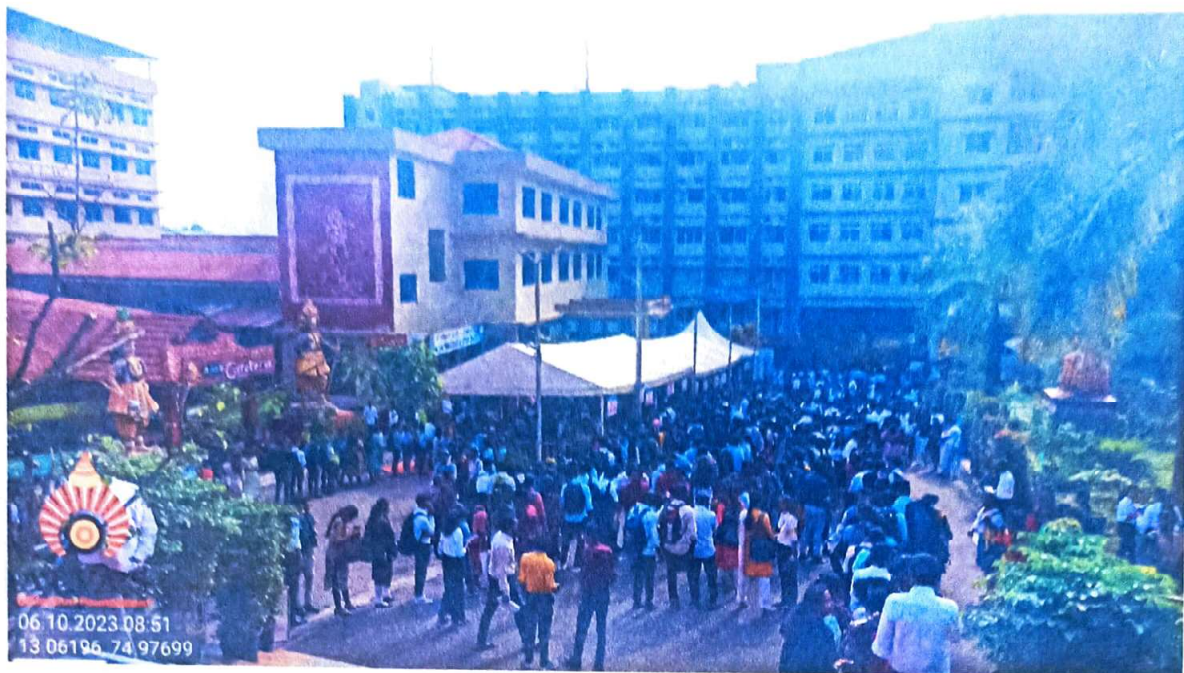
Job aspirants crowd on the day of Alva's Pragati