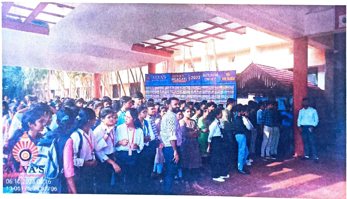
Volunteers' team awaiting to take-up their responsibility

Outcome: Through volunteering at Alva's Pragati job fair, NSS volunteers gained valuable skills in communication, organization, and teamwork. They also deepened their understanding of community engagement and developed a sense of responsibility towards society, fostering personal growth and empathy.