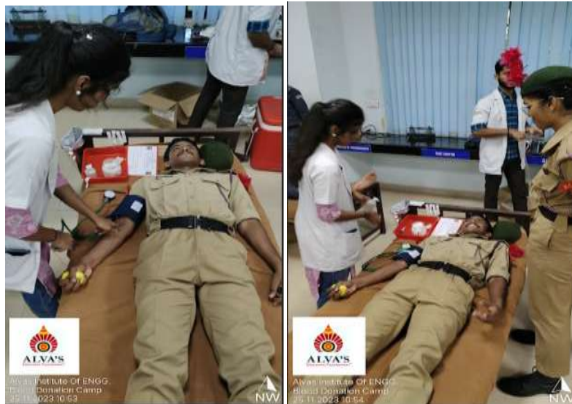
Figure 2: NCC Cadets donating Blood