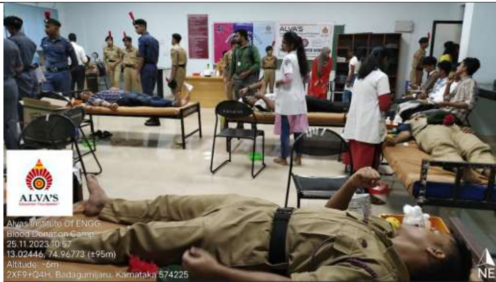
Figure 3: NCC cadets participating in Blood Donation Camp