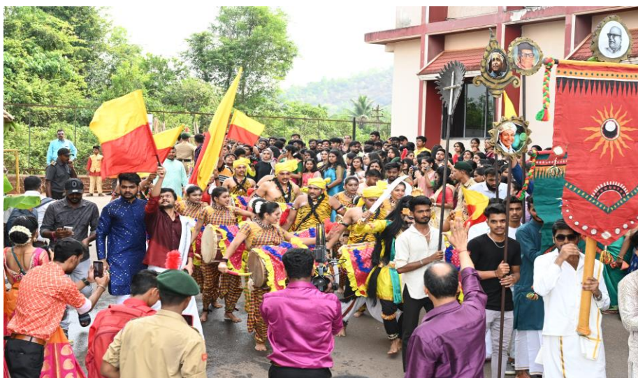
Student Celebrating College Traditional Day

The Traditional Day was dedicated to a series of cultural performances in the college's amphitheater. Students showcased their talents through dance, music, and theatrical performances. The diversity of acts was truly remarkable, showcasing the global nature of the college. A major highlight of the event was the traditional food festival. Various student organizations and local vendors set up stalls, offering a wide array of traditional dishes from different regions. This not only delighted the taste buds but also encouraged cross-cultural exchange and appreciation.