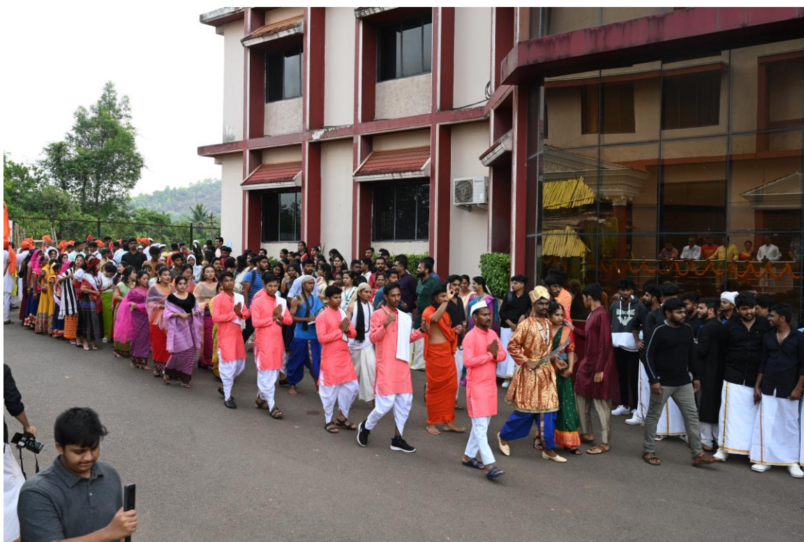
Student Dressed to Showcase their Traditional Costume