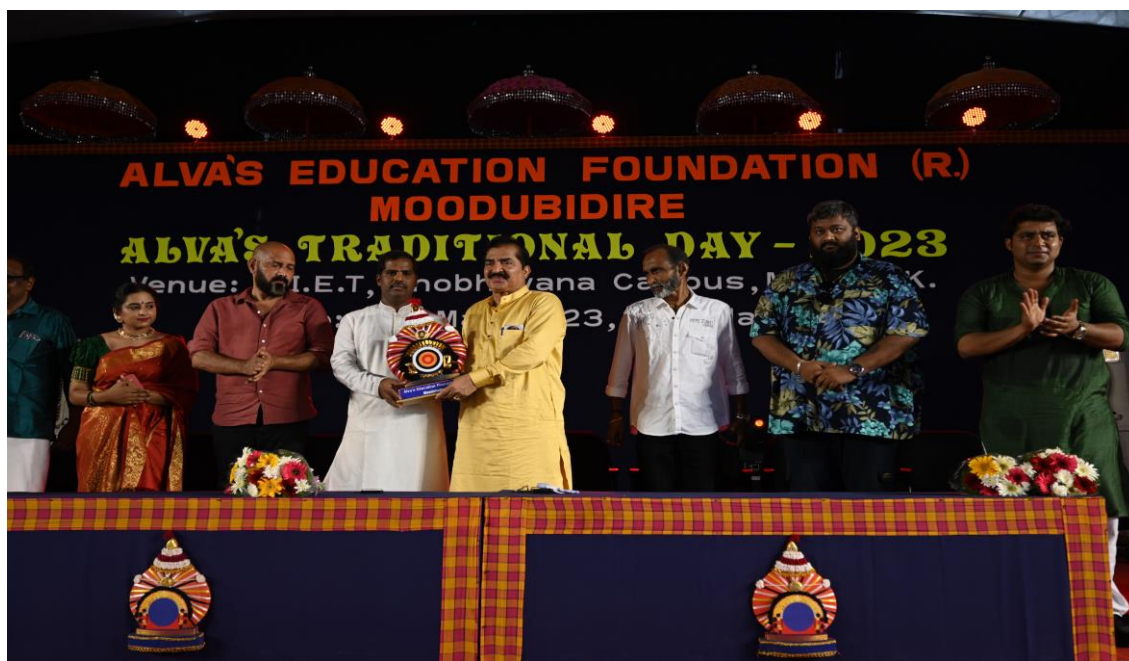
Chairman of AEF presenting Memento to Guest