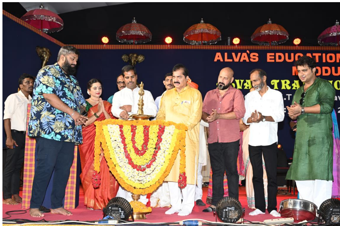
Traditional Day inaugurated by lighting lamp