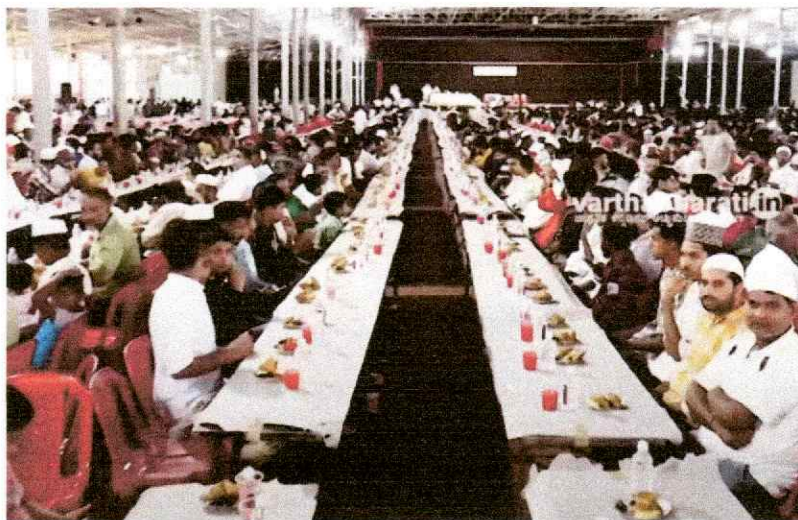
People seating for iftar at Alva's Ifthar koota -2023

Iftaar koota was organized on 30 th March at 6.00pm in Nudisiri Vedike, Vidyagiri. All the Deans', HODs', Teaching and Technical staff accompanied this event with more than 1200 students of Alvas Education Foundation. Students preparing for evening prayer made wudu. Followed by the prayer, water, fruits and dates were served to break the fast. All performed prayer of Maghreb. Then delicious dinner was served for all who attended Iftaar Koota.