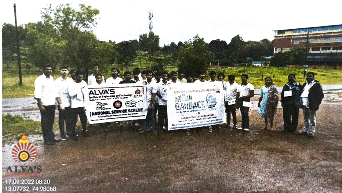
NSS volunteers with TMC-Moodbidri staff

Key outcomes include: Significant waste removal and proper disposal during cleanliness drives; Increased awareness among residents about waste segregation and responsible waste management practices; Enhanced community engagement and collaboration for a cleaner and healthier environment; Empowerment of youth as change agents, leading the way towards garbage-free cities; Strengthening of the Swachh Bharat (Clean India) mission through widespread citizen participation.