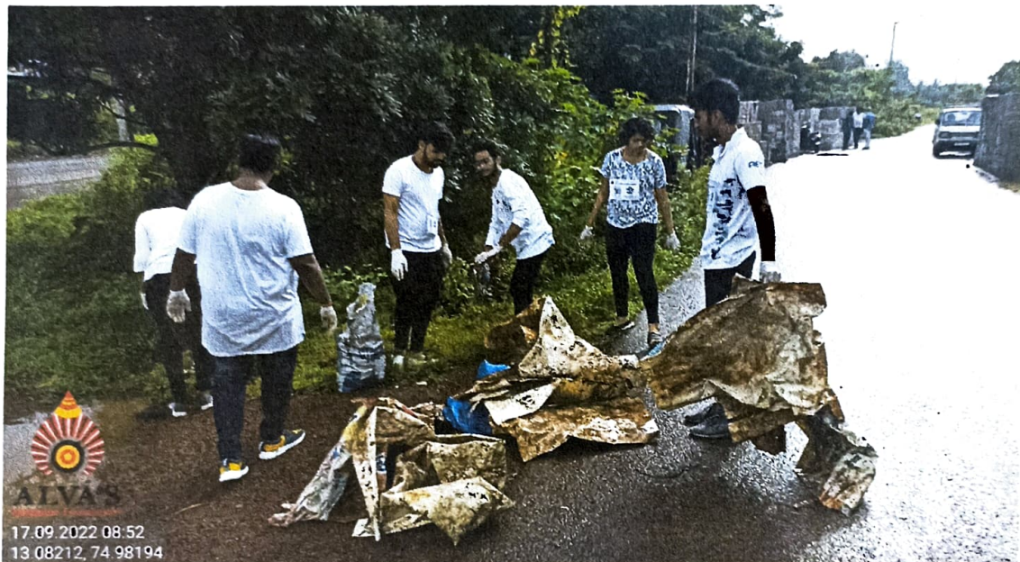
Volunteers in action