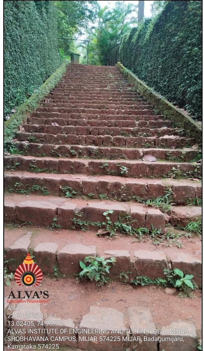
Pedestrian friendly pathways at Shobhavana entrance.