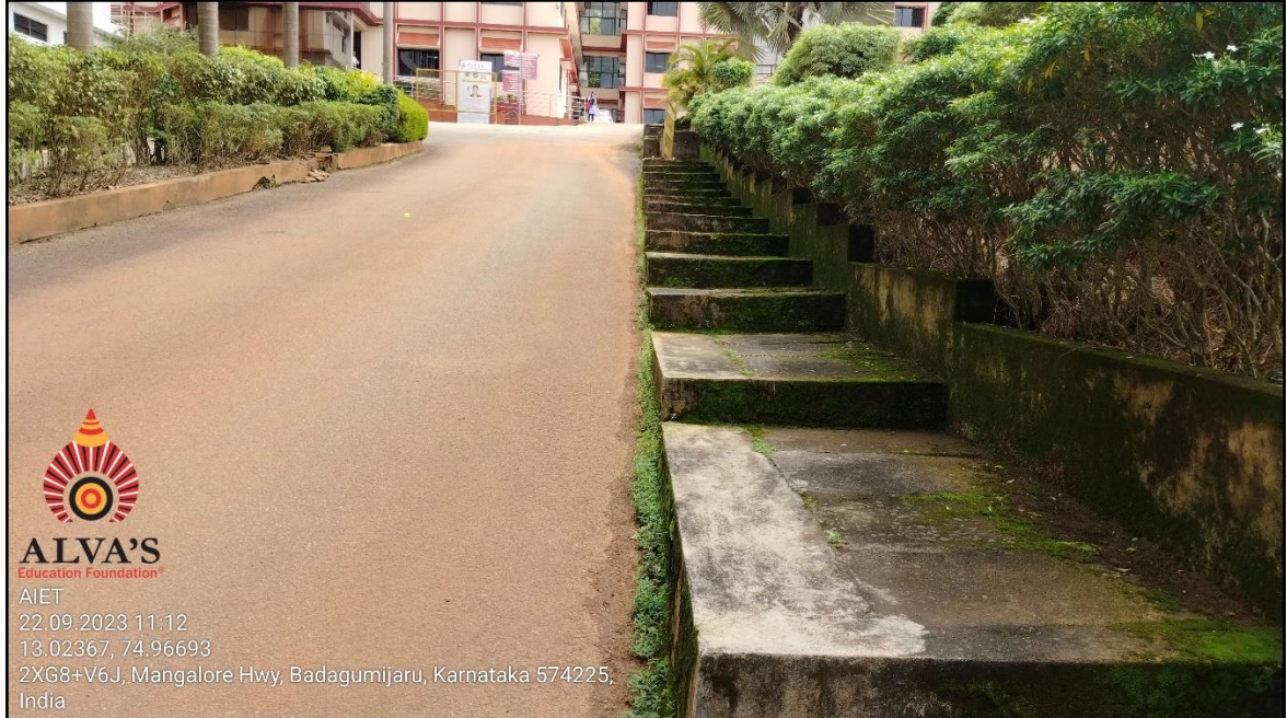
Pedestrian friendly pathways at AIET entrance.