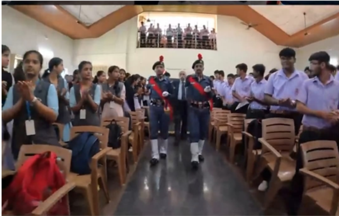
Air-wing NCC cadets are escorting/piloting the Major General.