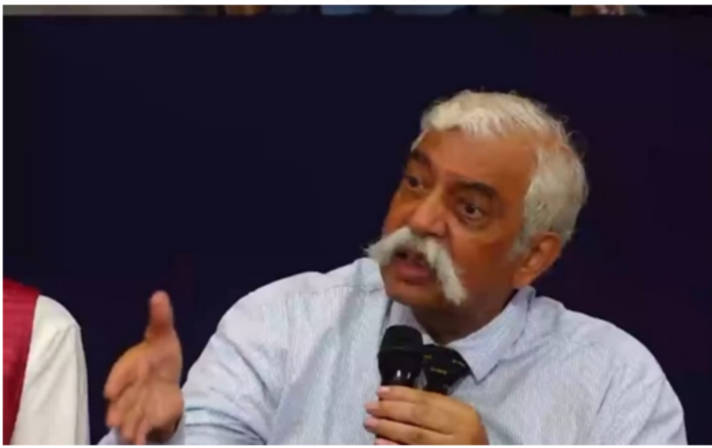
Answering the questions of Air-wing NCC cadets and students of AIET

Outcome: The students of AIET have gained knowledge of policy development, information sharing, threat assessment, resource allocation, international cooperation, legislation, public awareness, crisis management, diplomatic initiatives, etc.