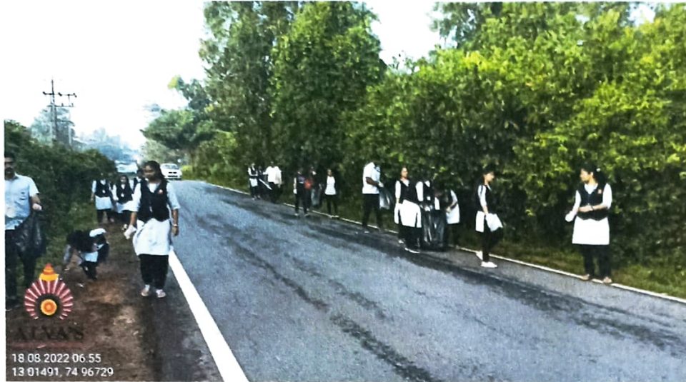
Volunteers under action