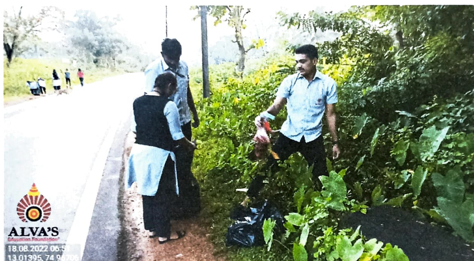
Volunteers under action

The activity aimed to promote cleanliness and hygiene in the surrounding areas. Students develop a sense of responsibility towards the environment and community. Cleaning activities provide an opportunity for students to engage in physical activity and develop teamwork and leadership skills.