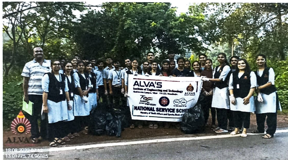
A moment to feel a sense of pride and accomplishment