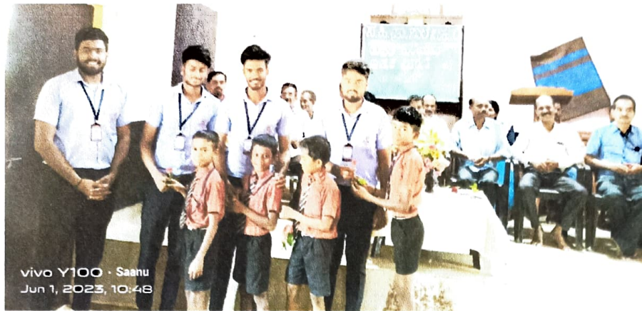
Volunteers welcoming the students