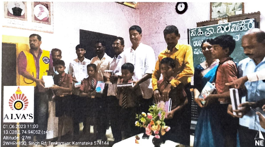
Students with their academic kits