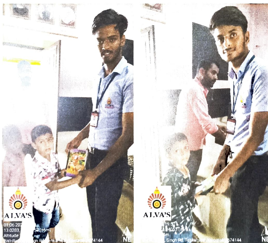
Volunteers donating the academic kits to the students

Outcome: A total of 350 underprivileged students at Govt. Primary School - Neerkere benefited from this initiative. By receiving the necessary school essentials, these children are now better equipped to actively engage in their education. The provision of basic supplies aims to alleviate financial burdens on their families and create a conducive learning environment. By providing school essentials to underprivileged children, we have taken a step toward empowering them academically and promoting inclusivity in education.