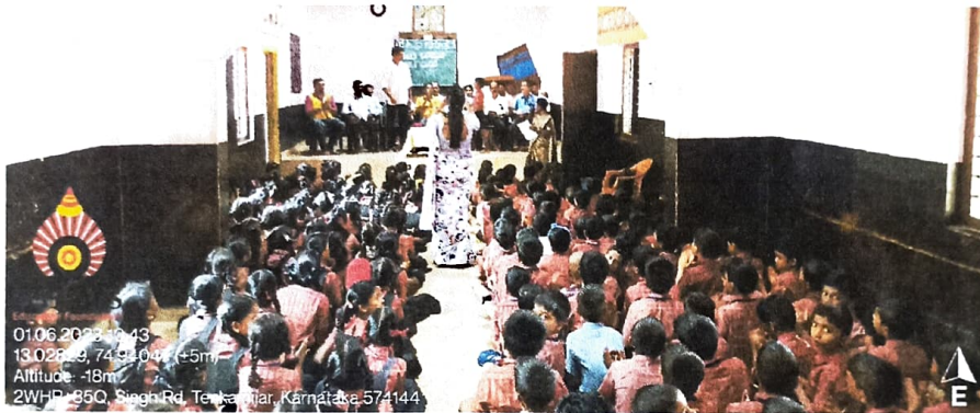
Students in the inaugural function