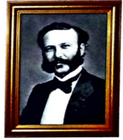
Jean Henry Dunant Founder of Red Cross (1828-1910)