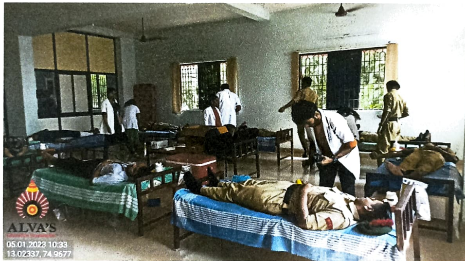
Voluntary donors donating blood at the camp