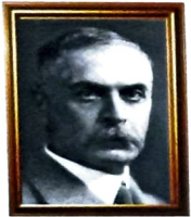
Karl Landsteiner Discoverer of ABO Blood Group System 1900