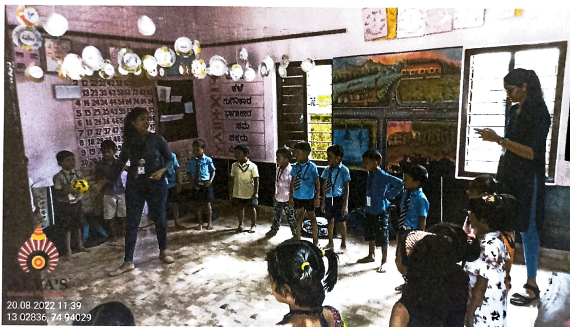
Fun games for the schoolchildren

Outcome: Over 160 schoolchildren of Govt. Primary School, Neerkere, were benefitted and it provided much-needed support to the underprivileged children. The volunteers learned how to highlight the importance of education and the role that community support can play in promoting it.