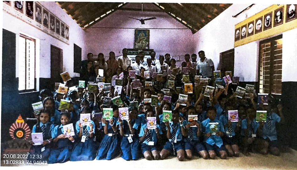
Kids with their school utilities received