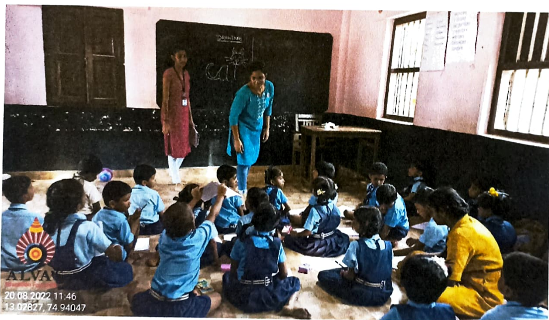
How to draw animals made out of their names, Session by the volunteers