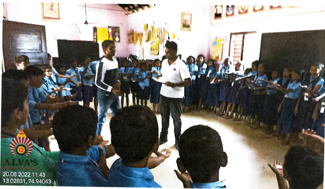
Fun games for the schoolchildren